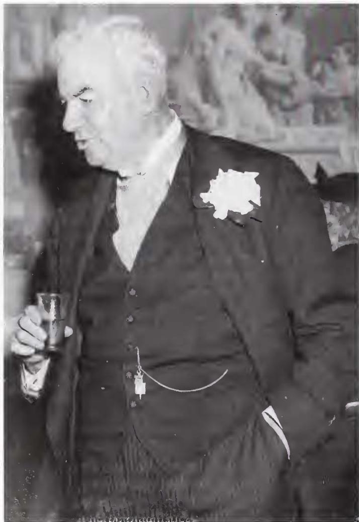
Fig. 1: Thomas BARBOUR.

In stark contrast to EKMAN's Spartan approach to field work, picture, if you can, the opportunity provided by access to a 70-meter-long (230-foot) yacht with a crew of 30 and a sailing radius of 12,000 miles (22,000 km). Picture further this vessel on the amazingly blue waters of the Caribbean, going from the palm-lined shores of one sun-drenched island to those of another in search of amphibians and reptiles. Living conditions aboard the yacht are very comfortable, food is of gourmet quality, yet laboratory space for specimen preparation is available and an automobile is carried below deck for excursions on land. This was life on the Utowana , the ship on which Thomas BARBOUR (1884–1946) (Fig. 1), certainly the most influential herpetologist working in the West Indies during the first half of the 20 th century, visited many islands between 1929 and 1934.